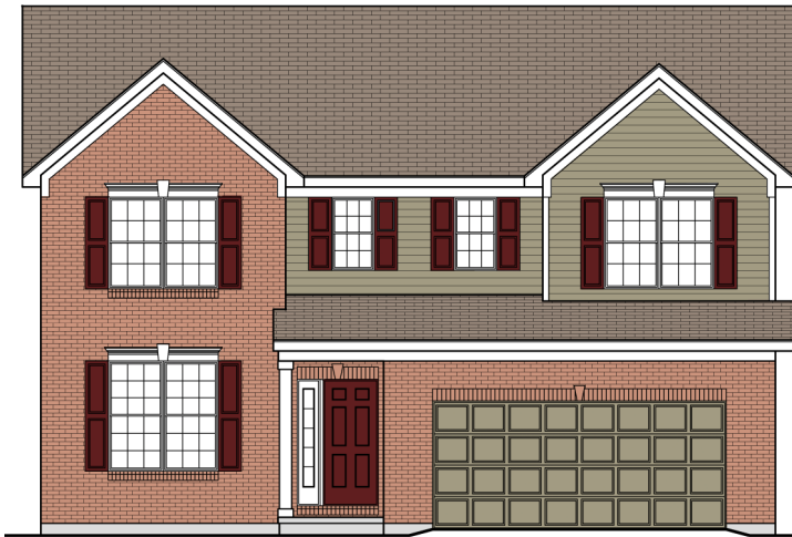
Front Elevation A