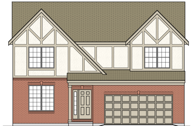
Front Elevation B