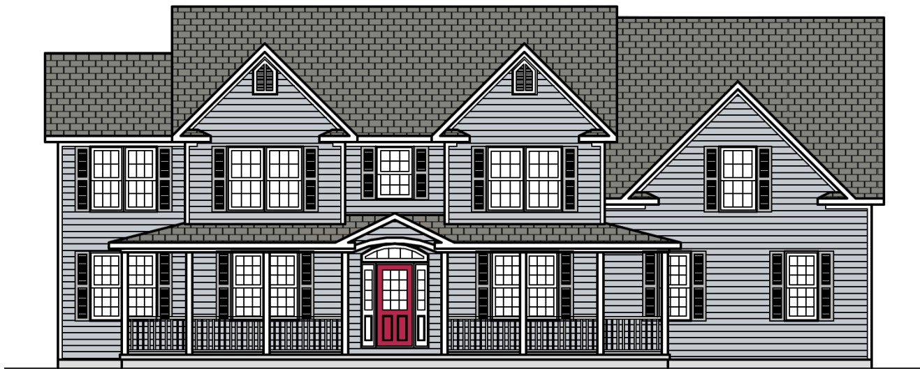
optional railing shown